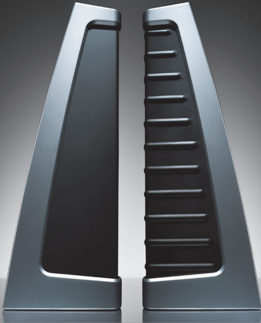
Flextight X1 and Flextight X5